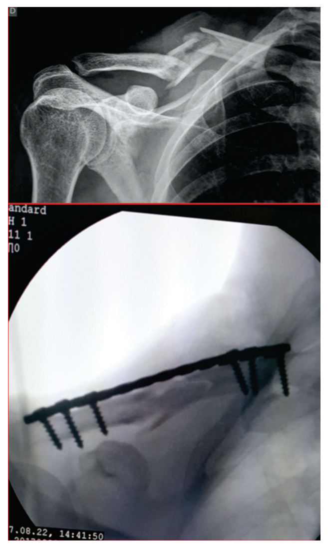
Fig. 4 Before and after fixation with the minimally invasive osteosynthesis (MIO) technique.

For statistical analysis, descriptive data was expressed as frequency, mean and standard deviation (SD) tables. The Fisher exact test analyzed associations between categorical variables. Paired t-tests compared the operated and nonoperated sides for continuous numerical variables. Error normality was analyzed by box plot, quantile-quantile graph