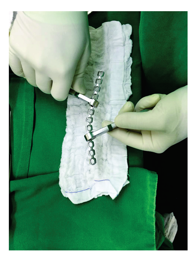
Fig. 3 Plate modeling.

determined at radioscopy. The plate was slipped in the supraclavicular tunnel from medial to lateral, with the scapula kept in a retracted position. Provisional fixation was performed with 2.5-mm Kirchner wires (for length evaluation under radioscopy), and the plate was fixated with 3 bicortical screws on each side, alternately, starting from the medial side. Reduction and final plate and screws positioning were verified ( Figure 4 ). Wounds were irrigated with 0.9% saline solution; deep layers were closed with 3.0 mononylon sutures followed by 2.0 intradermal sutures.