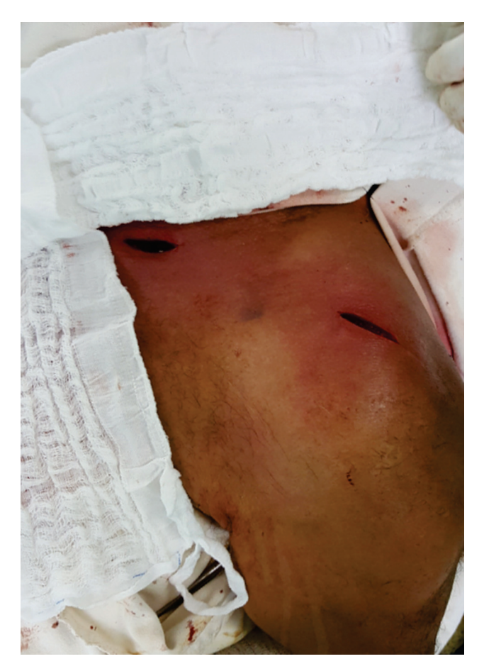
Fig. 2 Medial and lateral incisions.

Surgical technique (adapted from Jung et al. 18): patient in the beach chair position; the procedure was aided by radioscopy in frontal and modified craniocaudal views of the clavicle with an approximate inclination of 70° (► Figure 1). A fracture reduction maneuver (the Kibler maneuver) was performed; the surgeon put the ipsilateral arm to a posterior, slightly superior position, with lateral rotation of the shoulder, approximating the scapula to the rib cage with lateral, superior rotation and posterior scapular inclination (a position mimicking retraction), leading to the indirect clavicle fracture reduction. Using radioscopy, the clavicular length and shape were determined to choose the implant size (3.5-mm, unlocked reconstruction plate). Next, the medial and lateral ends of the clavicle were palpated to locate the sternal and acromial borders, respectively. A transverse incision 1 cm lateral to the sternal border, with \sim 1.5 cm, was performed on the upper surface, with deep plane