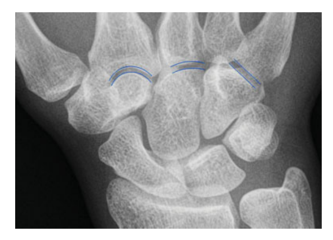
Fig. 1 Radiograph of the front of the normal wrist region, showing the parallelism between the articular surfaces.

Fisher et al.<sup>9</sup> described the parallelism that must exist in the articular surfaces of the second row of the carpus ( ¬Figure 1 ). On the posteroanterior (PA) view, if an absence of this congruence is already identified, the lesion should already be suspected.