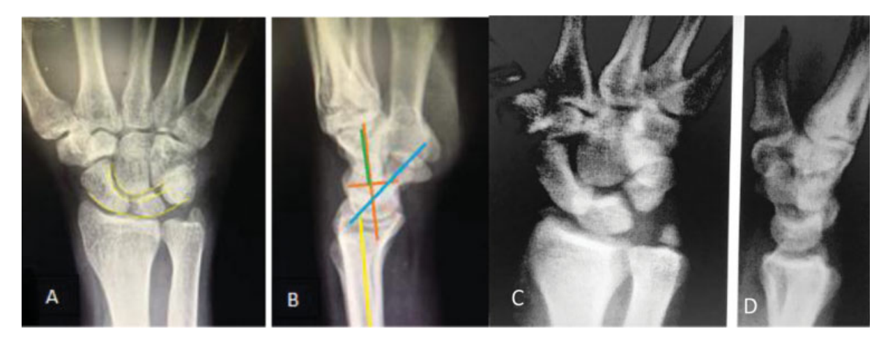
Fig. 3 (A) Gilula arches and (B) axes of the carpal bones with the radius (necessary for measuring misalignments and dislocations). (C and D) Posteroanterior (PA) and lateral radiographs of a perilunar fracture-dislocation, with involvement of radial and ulnar styloid. Note the broken arches and loss of normal angulations.

as there is a risk of involving structures such as nerves and tendons.<sup>41</sup>