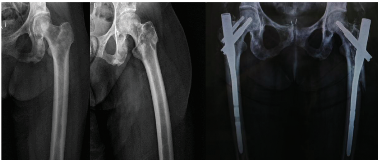
Fig. 2 Metastatic breast cancer lesion in the proximal femur in a 61-year-old patient with transtrochanteric fracture and impending contralateral fracture. The distal locking screw was not necessary due to stabilization with bone cement.

Conservative treatment showed the worst results, with higher morbimortality; thus, surgical treatment is the standard treatment for pathological fractures. 22 Osteosynthesis showed a lower rate of complications when compared with an endoprosthesis, as it allows immediate support. 23 The use of long nails is the most chosen and indicated method, as it prevents future injuries as the disease progresses. The