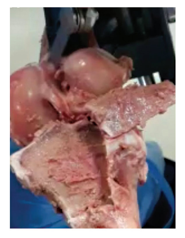
Fig. 3 Osteotomy of the femur between the cruciate ligaments.

To date, there is no description of removals of the cruciate ligaments with their bone insertions. The removal with the