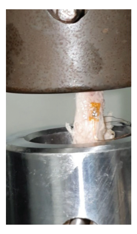
Fig. 4 Ligament coupled with strain gauge on the Instron.