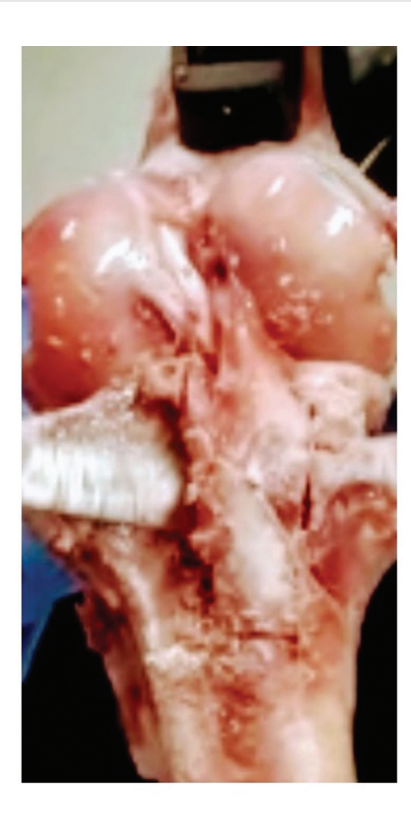
Fig. 1 Posterior vision of the knee with osteotomy of the tibial insertion.

et al.,<sup>7</sup> who removed the ligaments without the bone fragments.