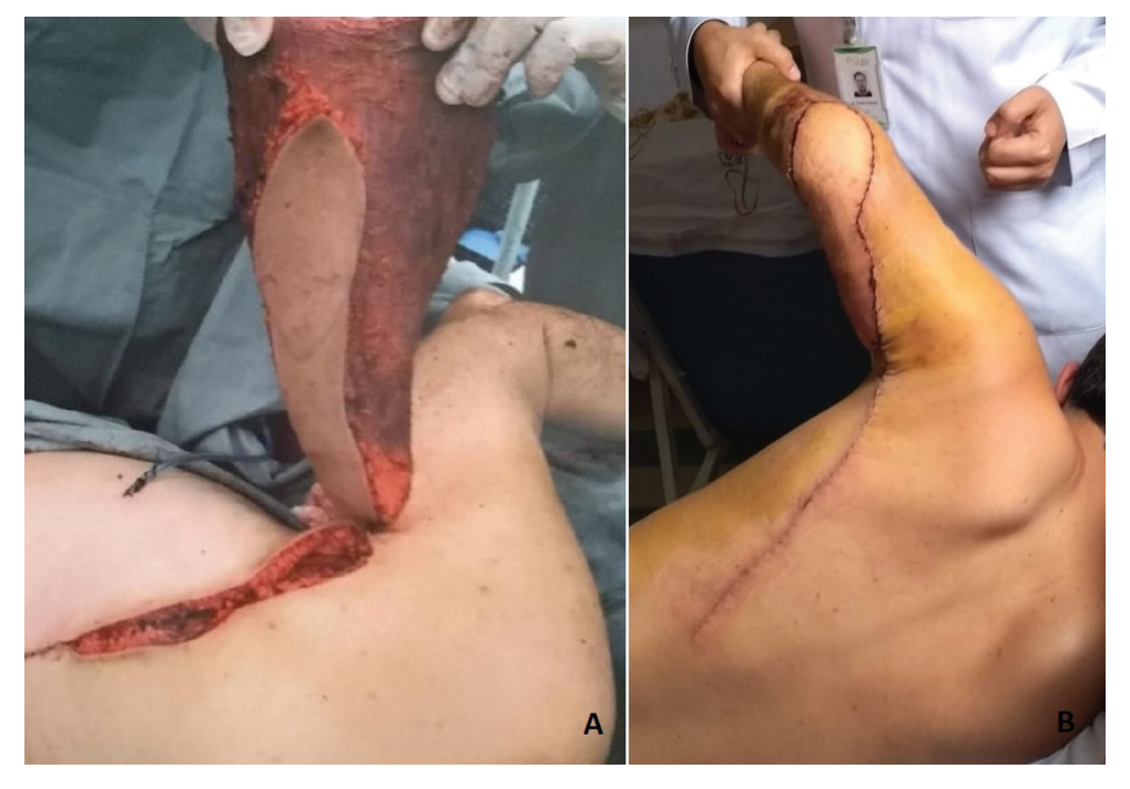
Fig. 2 (A) Perioperative (B) and postoperative image of the latissimus dorsi flap.

The patient had a hemorrhagic shock and hypothermia. Hemodynamic stabilization and transarticular external fixation of the left elbow were performed. Drug treatment was initiated with intravenous administration of cefazolin, 1 g every 6 hours, and amikacin, 500 mg every 24 hours. Then, the patient was transferred to the intensive care unit (ICU).