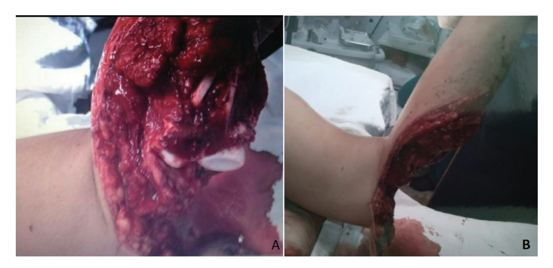
Fig. 1 (A/B) Image of the left elbow on the day of the trauma (before surgery).

Here, we report a case of a complex lesion with loss of the distal humerus, the proximal ulna, and the entire extensor apparatus. The ulnar nerve and collateral ligaments were also involved. The procedure consisted in triceps reconstruction with a graft from semitendinosus muscle tendon after latissimus dorsi flap rotation. A semi-constricted prosthesis was used, resulting in a functional upper limb.