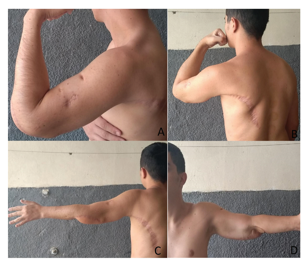
Fig. 5 (A/B/C/D) Current physical aspect and range of motion of the left elbow.

On December 17, 2015, the patient underwent surgical debridement of the elbow. Cefazolin was terminated and replaced with intravenous ceftriaxone, 1g every 12 hours, and amikacin, 500 mg every 24 hours; both drugs were administered until December 30, 2015, when the patient developed fever, cutaneous hyperemia, and local heat; thus, vancomycin, 500 mg every 6 hours, was intravenously administered up to January 20, 2016. On January 29, 2016, the patient was discharged from the hospital.