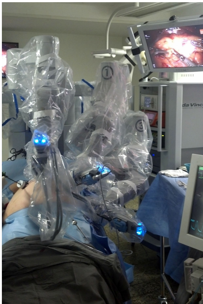
FIGURE 2 – Coupling of robotic arms to the trocars (docking)

As specialized robotic material, two Cadere forceps, one ultrasonic scissor and one needle holder were utilized. With the trocars in place, the robot (da Vinci Si Surgical System®, Intuitive Surgical Inc.) was approximated and the robotic arms connected to the trocars (docking) (Figure 2).