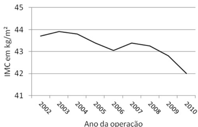
FIGURE 2 – Variation of the mean BMI in patients covered by health insurance (HMO) undergoing bariatric surgery from 2002 to 2010

The in-hospital mortality rate was 5.5 per 1,000 operated cases among patients covered by the SUS in Brazil. It was 3.0 per 1,000 operated cases among patients covered by a HMO. The gross relative risk was 1.84 (CI 95%; 1.04–3.20). The mortality rate was 4.4 per 1,000 operated cases among SUS-covered patients in Southeast Brazil; in this case, the relative risk was 1.47 (CI 95%; 0.79–2.72) compared to the death rate of HMO-covered patients (Table 2).