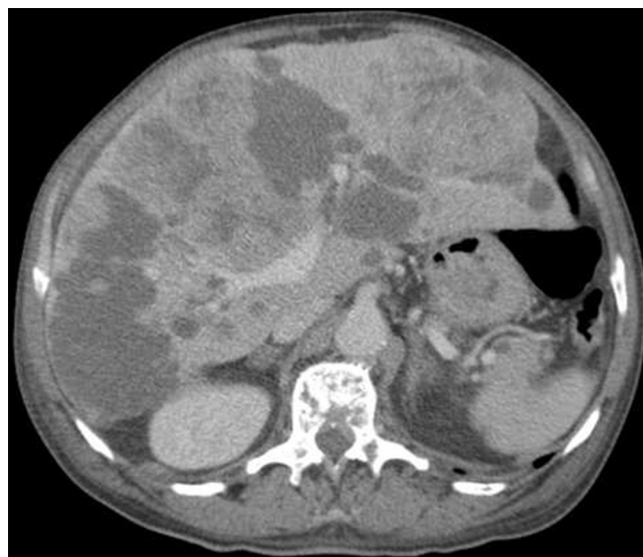
FIGURE 1 - Multiple hepatic metastases

A 79 year-old man with gastric GIST, receiving Imatinib for the presence of multiple hepatic (Figure 1), pulmonary and bone metastases, was admitted to the Cancer Institute of the University of São Paulo Medical School, São Paulo, SP, Brazil after presenting massive hematemesis, followed by syncope.