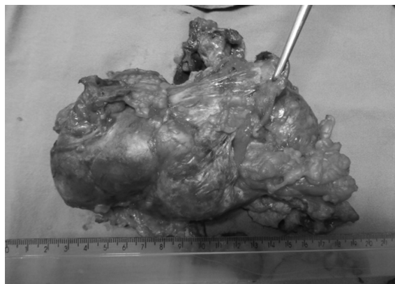
FIGURE 2 - Resected adrenal tumor