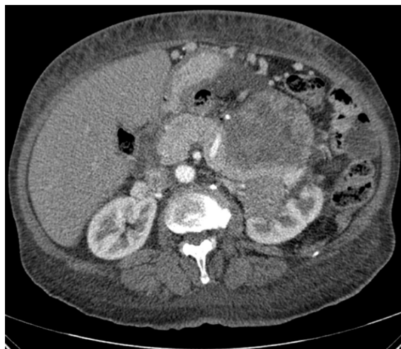
FIGURE 3 - Adrenal mass