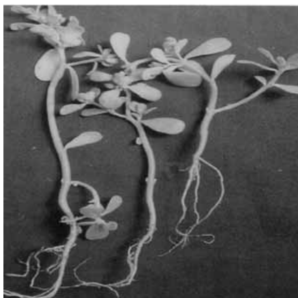
Figure 1. Macroscopy of the aerial aspect of Portulaca oleracea Linn.