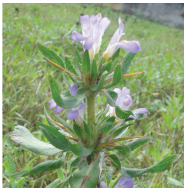
Figure 1: View of Asteracantha longifolia (L.) Nees, Acanthaceae.

A. longifolia has been used successfully in traditional Ayurvedic medicine for centuries, more clinical trials should be conducted to support its therapeutic use. A. longifolia is investigated for many pharmacological activities but still there is paucity for the mechanism and bioactive principles that are responsible for the activities.