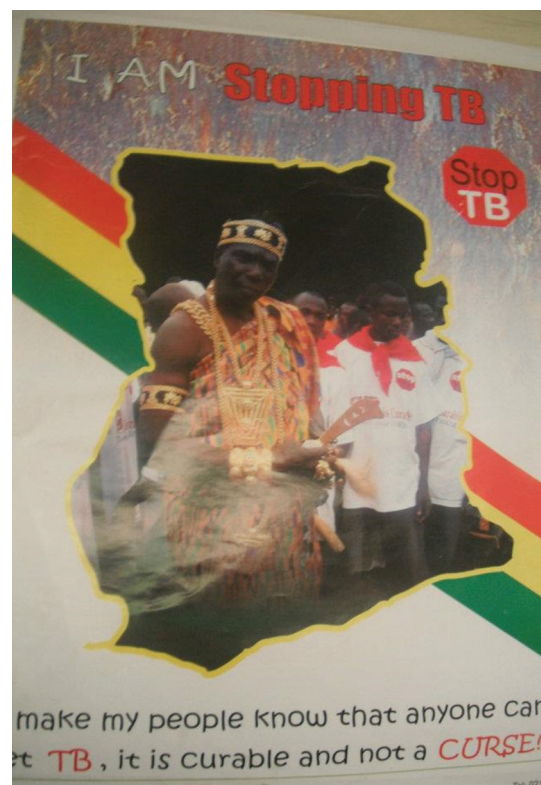
Figure 4 - Poster of a tribal chief motivating people to communicate TB (fixed in the Komfo Anokye teaching hospital, Kumasi, Ghana).

It can be seen, therefore, that there are efforts to organize a healthcare service for TB and other prevalent diseases that impact the health of the population, and that in general, the model adopted follows the international guidelines (Fig. 4). However, without economic, geographical, cultural and organizational conditions that are consistent with the models developed in and for other regions of the world, there is a delay, and significant limitations in health programs for dealing effectively with communicable diseases, which compromise their results. What is noticeable is the clear separation between the official healthcare system and the therapists (especially the traditional healers, but also to the new herbalists and therapists with some formal education), and the health programs are failing to capitalize, in a systematic way, on the influence, proximity and legitimacy of these professionals, especially those practicing in more remote regions, as support