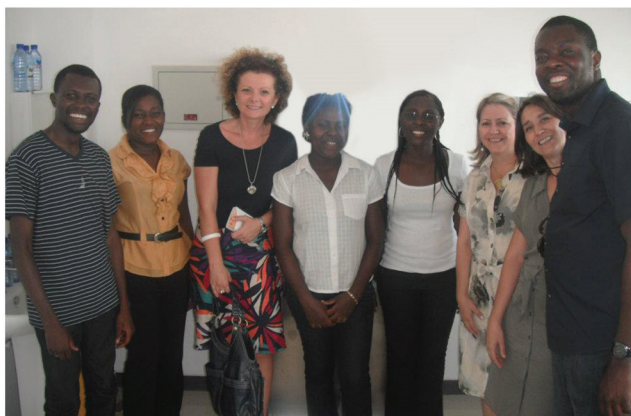
Figure 3 - Photo with the graduated herbalists. Lekma Hospital, Kpeshie, Accra, Ghana.

Among the communicable diseases, tuberculosis and AIDS are huge public health problems in Ghana. It is estimated that approximately 20,000 people contracted tuberculosis in that country in 2011, of which around 22% were not detected and notified (WHO-CIDA, 2012). According to 2011 data from the World Health Organization, 14,962 cases of tuberculosis were notified, comprising an incidence of 79 cases per 100,000. Of these, eighteen cases per 100,000 corresponded to co-infection with HIV-TB (WHO, 2011). The policy for dealing with TB/HIV co-infection in Ghana states that "No systematic, nationwide study has been conducted to assess the prevalence of TB/HIV co-infection in the country. However, it is estimated that the influence of HIV on TB has been increasing. Whereas in 1989 roughly 14% of Ghana's TB cases could be attributed to AIDS, by the year 2009 about