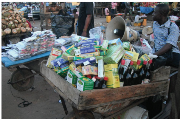
Figure 5 - Central Market, Kumasi, Ghana.