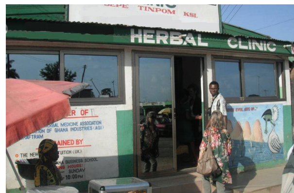
Figure 2 - A herbal clinic in Sepe Tinpom, Kumasi, Ghana.