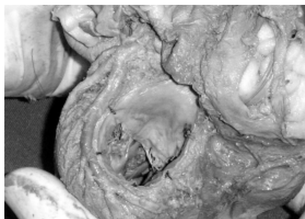
Fig. 2 – Anatomical specimen with balanced circulation. Anatomic relationship between the studied structures

Statistical analysis of the data was achieved using the Student-Newman-Keuls test to compare the mean distances. The data are presented as means and standard-deviations. A p-value < 0.05 was considered significant.