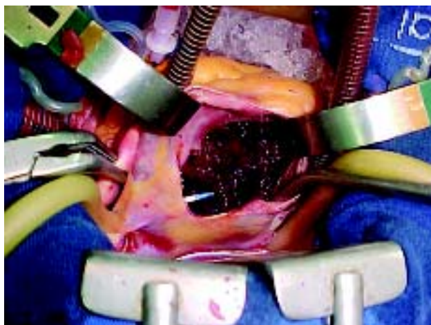
Fig. 2 – Right atrium myxoma – view of the voluminous tumoral mass after right atriotomy

initiated; 7. following cardiac arrest, with blood deviated completely from the right atrium, right atriotomy was performed exposing the voluminous tumoral mass without adherences to the heart structures (Figure 2), however with its pedicled base inserted in the interatrial septum near to the remnant of the oval foramen; 8. Exeresis was achieved by removing all the septal area connected to the tumor with subsequent septoplasty utilizing a bovine pericardial patch; 9. After closing the right atrium, the air was removed from the heart chambers in the normal way and the pulmonary and coronary circulation was restored; the heart returned to sinus rhythm; 10. With the normalization of the body temperature, the CPB was disconnected and after the cannulae were removed from the vena cavae, the heparin was neutralized by the administration of protamine chloride at 1 mg for each 100 IU of heparin utilized for anticoagulation. After the surgery was completed, the tumor was measured (2.5 x 5.5 cm) and sent for histopathologic which confirmed the diagnosis of myxoma. The immediate postoperative course was event free with the patient staying in the ICU for the first two postoperative days and being released from hospital on the 7 th postoperative day without signs or symptoms of heart failure.