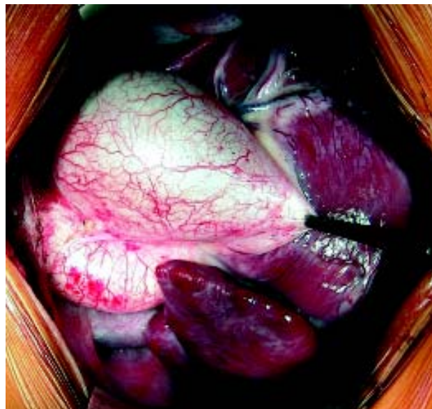
Fig. 2 – Appearance of the aneurysmatic pulmonary artery

A median transsternal thoracotomy was performed with the establishment of cardiopulmonary bypass. The cannulae were introduced into the aorta and both vena cavae. Hypothermia at 34^\circ\text{C} was used together with intermittent anterograde sanguineous cardioplegia at 4^\circ\text{C} . After opening the pericardium, a severe aneurysmatic dilation of the pulmonary artery (Figure 2) was observed and when opened lengthwise a bi-cuspid pulmonary valve was observed, which was thin but with apparently normal movement (Figure 3). A pulmonary valvar commissurotomy was performed and the aneurysmatic wall was resected. The ostium secundum-type IAS was repaired with a bovine pericardium patch sutured using 5-0 polypropylene thread. The perfusion time was 45 minutes and the myocardial ischemia time was 30 minutes. The patient evolved well and was released from hospital on the 5 th postoperative day.