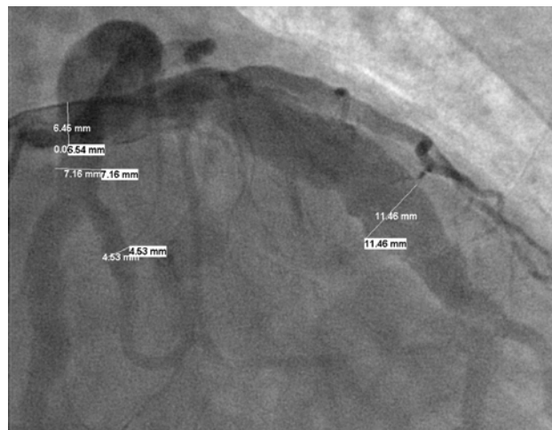
Fig. 2 – Coronary angiography showing the left, anterior descending and circumflex coronary arteries with considerable dilations

The hemodynamic evaluation showed left ventricular end-diastolic pressure remarkably high. As it was diagnosed dilated coronary artery and CABG would not lead to a resolution of the presentation, the patient received authorization from the cardiology team and underwent kidney transplantation, and was guided to make strict follow-up with cardiologist thereafter. As the patient presented coronary calcification, atherosclerosis seemed to us the most probable cause.