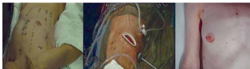
Fig. 2 – Preoperative marks, transoperative aspect and evolution of the periareolar wound in 30 days

With the introduction of optics in the left atrium, the mitral valve was inspected on which a partial rupture of the chordae to the anterior leaflet was revealed. Three points of 2.0 braided polyester were passed, the first in the posterolateral fibrous trigone, the second in the anterolateral fibrous trigone and the third in the posterior region of the mitral annulus and exteriorized through the minithoracotomy with the aim of rectifying the valve. We opted for the preservation of this valve using the technique of implantation of neochordae of PTFE, with pre-measured loops of Gore-tex® wire - CV5 [1]. Using a specific meter (Geister, inc), the distance between the right plan of valve closure was measured in areas adjacent to non-