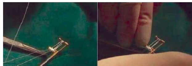
Fig. 1- Confection of the PTFE loops

Surgical correction consisted of mitral valve repair, using neochordae of PTFE (Gore-Tex) [1] (Figure 1) for anterior leaflet and annuloplasty with semi-rigid ring Carpentier-Edwards Physio Ring® (Edwards Lifesciences). The video-assisted minimally invasive periareolar approach [2] was chosen. The cardiopulmonary bypass (CPB) time was 98 minutes (min) and aortic clamping was 73 min.