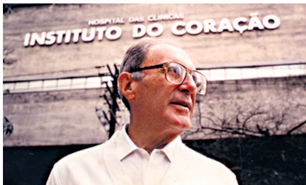
Fig. 2 - The Heart Institute (INCOR) was one of Dr. Zerbini legacies