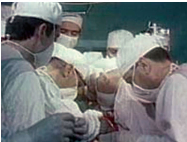
Fig. 1 - Dr. Zerbini and his staff conducting the 1st heart transplant in 1968