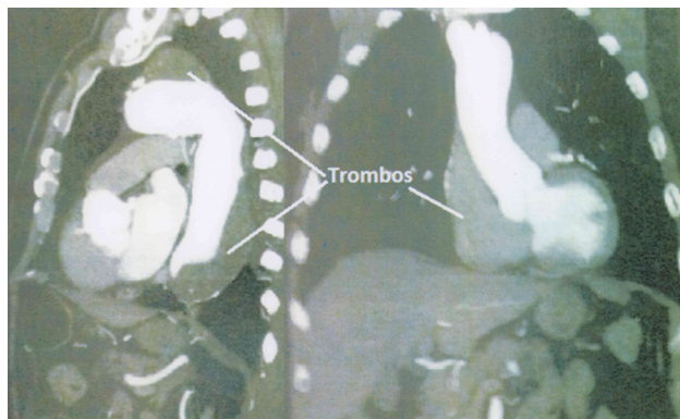
Fig. 2 - Thrombosed false lumen of the ascending aortic arch and descending aorta: type A aortic dissection with spontaneous resolution. Trombos - Thrombi