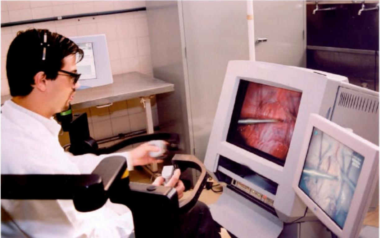
FIGURE 2 - The main surgeon is in the control console of the Zeus ® , geographically apart from the main OR, dissecting the bladder under a three-dimensional image.

The assistant surgeon located in the main operating room established the pneumoperitoneum and placed 5 trocars in a fan configuration (Figure 1). The 30 degree laparoscope and the laparoscopic instruments attached to the robotic arms were inserted in the abdominal cavity through trocars already placed by the assistant surgeon, beginning the procedure. The assistant surgeon remained besides the operating table throughout the procedure, exchanging the laparoscopic instruments used by the surgeon, performing tissue traction and clip placement during ligation of the lateral pedicles of the bladder, always following the surgeon's command. The bladder was grasped and dissected out with endoshears by the main surgeon, followed by urethral section and complete bladder removal, thus, completing the procedure successfully within 25 minutes, with no bleeding. No reconstruction was performed and the animal was killed with anesthesia overdose and saturated potassium chloride injection at the end of the surgery.