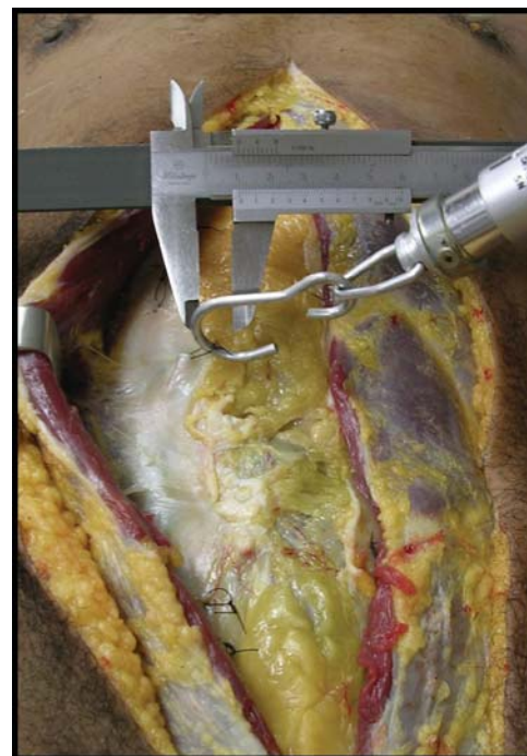
FIGURE 2 - Photograph illustrating the use of the dynamometer and the analogical paquimeter