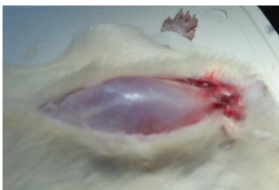
FIGURE 3 - Urine retention