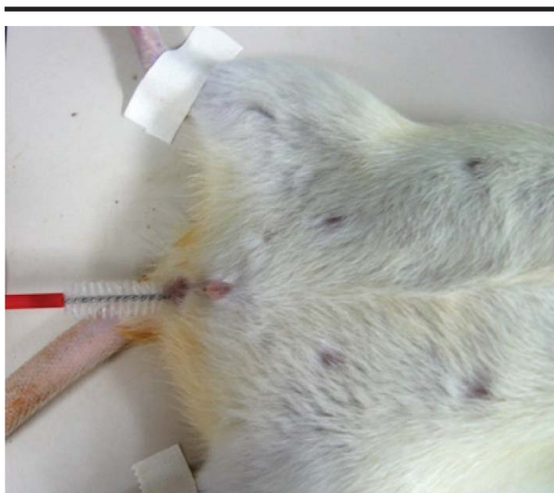
FIGURE 1 - Vaginal scraping

The day before tumor cells inoculation on the assigned groups, the rats were anaesthetized with diethylether and 0,3 ml of acetic acid was inoculated into the rats' vaginas. Tumor cell inoculation into the vagina and cervix was done under general anesthesia with diethylether. Then a endocervical brush was used to scrape the vaginal wall (Figure 1) and after that 0,3 ml of the liquid containing tumor cells was inoculated on the vagina and cervix. For the tumor analysis, animals were euthanized at day 12 following tumor cell implantation by an excessive inhalation of diethylether. A laparotomy was performed in order to analyze the presence of macroscopic metastasis sites and to allow the removal of uterus, vagina, cervix and rectum for further analysis and separation of cervix and vagina. Tumor was resected entirely and weighed, representative photographs were taken and the tumors were then sectioned and counter stained with hematoxylin and eosin for histopathologic evaluation. It was also calculated the percentage of tumor weight equivalent to the body weight by the formula: P = \text{tumor weight} / \text{body weight} \times 100 .