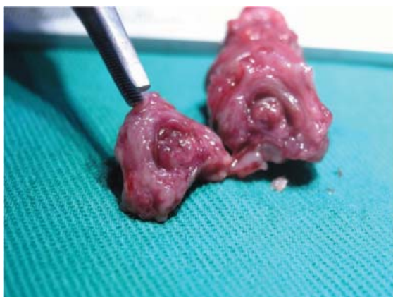
FIGURE 2 - Isolated vagina and cervix uteri

Walker 256 carcinoma inoculated on vagina and cervix had an implantation and growth rate of 100% on groups B and C and only 20% on group A. There were no distant metastasis sites and near structures were affected by contiguity (Table 1). The tumor affected the entire organ, obstructing the path (Figure 2). In addition there was expansive growth with urethra and rectum compression, causing urine and feces retention (Figure 3). Microscopically, the entire organs' walls were affected by the neoplasm, with loss of their normal characteristics. The cell line was undifferentiated (Figure 4). There were no statistical difference between groups B and C (Table 2).