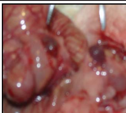
FIGURE 5 - Photomicrography of self-transplantation degree II for growth degree according to Quereda et al 5 , showing the occurrence of two focus from one single patch self-transplantation.