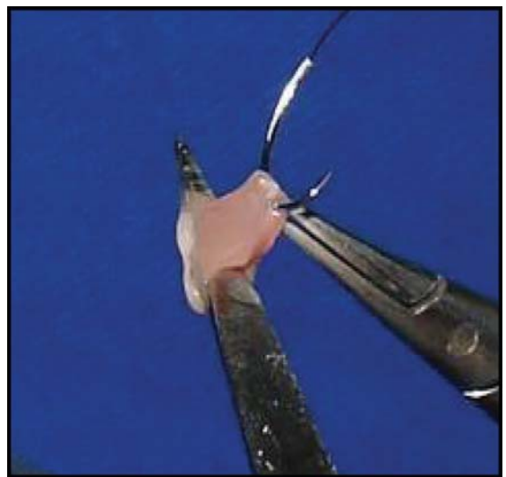
FIGURE 1 - Photomicrography of the left uterine horn patch, during 6-0 nylon stitch passing through the patch surface.

A 3 cm midline incision was carried out with 15 Fr scapel assaulting skin, aponeurotic-muscle plan and peritoneal, followed by identification of the peritoneal cavity organs and exposition of the uterus, annexes and mesentery. The left uterine horn was transected 5 mm cranial to the junction between the two cornua. Concomitantly, the extracted part of the uterus was sliced in longitudinal cuts followed of transversal cuts forming remnants with measures of 4mm x 4 mm, in liquid area with Ringer Lactate, where nylon point of 6-0 in the serosal surface of the remnant was transferred and kept wire repaired (Figure 1).