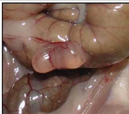
FIGURE 4 - Photomicrography showing self-transplantation mostly found in our study, degree III in the implantation classification system for growth degree according to Quereda et al 5 , with diameter above 4,5mm.