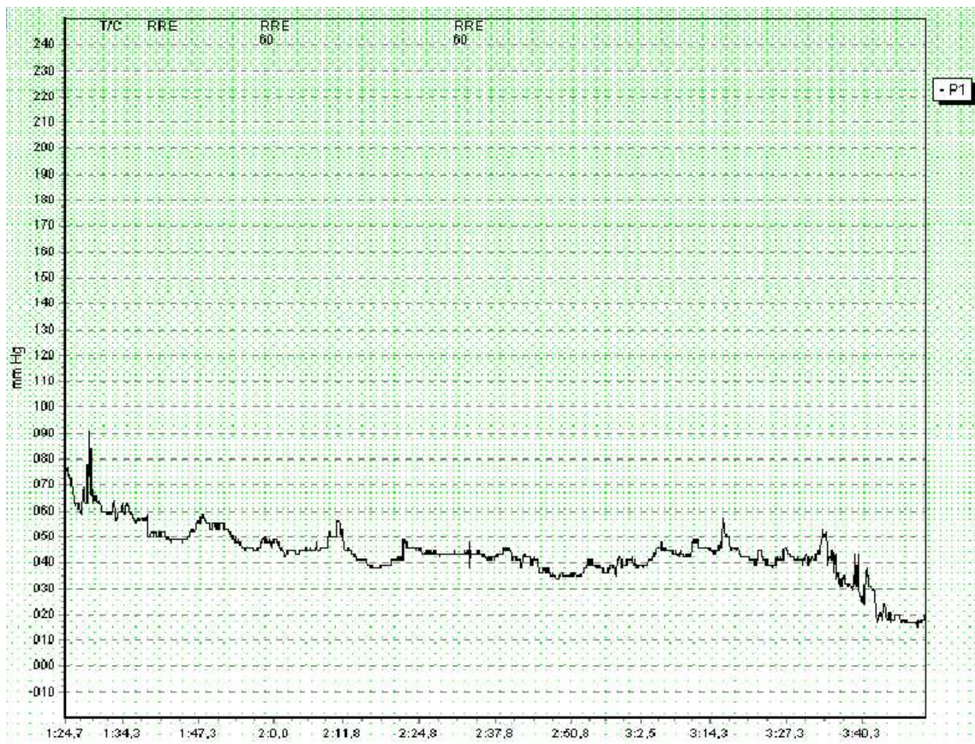
FIGURE 2 - Computerized anorectal manometry using the balloon technique

amplified and the results were recorded and analyzed using the Proctomaster®-Dynamed software. In the computerized anorectal manometry using the balloon technique (Figure 2), a flexible catheter of 5 mm in diameter was utilized, with a 5 mL balloon, calibrated at 100 millimeters of mercury (mmHg), and with a lumen at its tip for inflating a latex balloon with a maximum capacity of 200 mL.