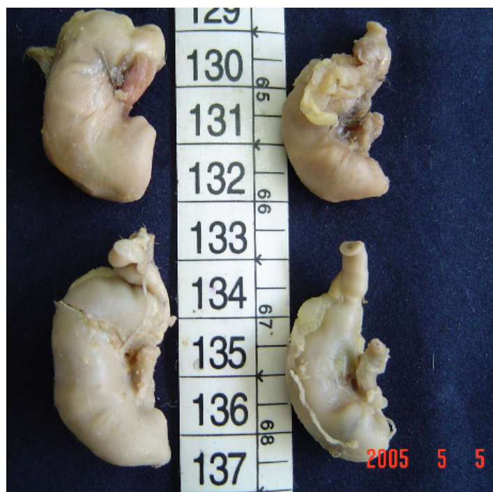
FIGURE 2 – Stomachs extracted from the abdominal cavity revealing the external macroscopic anatomy of the rats. Examples of group I on the right and group II on the left can be observed

on October 15th, 2003. After the realization of euthanasia performed through acute bleeding by cardio pulse under anesthesia (xilazina and ketamine 3mg/kg/IM), and the blood sent to laboratorial analysis of transaminases and alkaline phosphatase, it was realized a laparotomy through an incision of the stomach until its complete exposure. Following, the distal zone of the esophagus and the proximal duodenum was dissected with the scalpel and the organ was extracted from the abdominal cavity (Figure 2) so that it could be conditioned in glasses recipients containing neutral formalin at 10% in phosphate tampon. The macroscopic morphology of the organ was studied, so that a comparison of its size in a closed situation could be performed in order to realize the stomach's insure through its small curvature, and comparatively observe the differences in the internal morphologic formation.