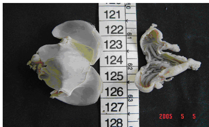
FIGURE 4 – Examples of the group G I at right and group G II at left, revealing the extinction of the linear depressions of the gastric mucous organ of the animal that ingested gasified water

The internal macroscopic observation of the stomach, realized through its exposition with the incision in the small curvature of the duodenum until the posterior part of the gastric bottom, reveals accentuated difference, occurring extinction of the linear depressions of the mucous organ in the animals that made use of gasified water when compared to the animals that utilized no gas water, as it is illustrated in Figure 4.