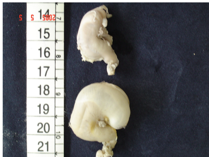
FIGURE 3 – The figure shows the examples of GI located at the top of the picture and G II at the bottom of the picture, revealing external macroscopic differences of the rats' stomachs

The external macroscopic gastric morphology of the studied animals was found different in animals that used gasified water, in relation to the ones that did not use it. The results demonstrated the following main characteristics: global expansion of the external volume of the organ (GII) and increase predominantly acute of the gastric bottom (GII). These differences are illustrated in Figure 3.