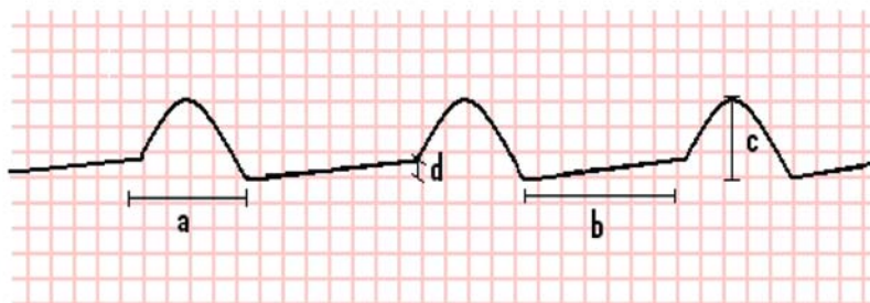
FIGURE 1 - Bladder pressure before surgical vesical denervation. Pressure peaks represent vesical contractions. Other variable are deduced from tracings as shown: (a) duration of contraction; (b) maximum cystometric capacity; (c) maximal bladder pressure; (d) threshold pressure.