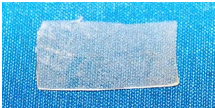
FIGURE 1 - Photograph of the polylysine latex biomembrane.

the tympanic membrane in contact with the temporalis fascia graft. The transitory implant rested on gelfoam and an otologic pomade containing polymixin and bacitracin. In group 1 patients, the graft was placed on gelfoam and the otologic pomade containing polymixin and bacitracin according to the standard tympanoplasty or myringoplasty technique (Figures 1 and 2).