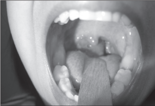
Figure 1 - Oral clinical examination performed in patient 1 during medical visit: remarkable asymmetry of size and shape of the right palatine tonsil, crossing the midline