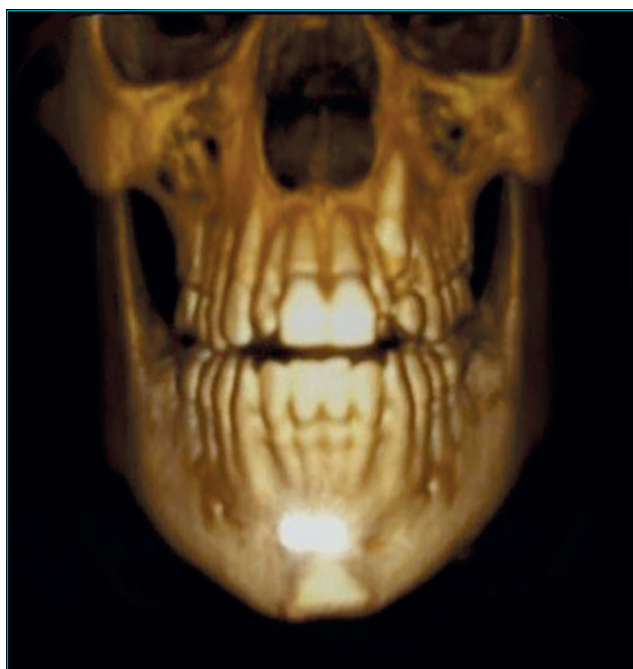
Figure 2 Frontal three-dimensional image.

The present report shows absence of differences in radiographic density of pigmented teeth in relation to enamel organ, without color change after cone-beam volumetric CT scan. This method allows examining the human body in segments with few millimeters of thickness, which helps to diagnose pathologies that affect bone tissues, besides