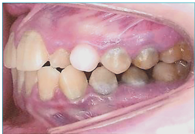
Figure 1 Intraoral view with prolonged retention of left superior deciduous canine and greenish pigmentation of teeth.

Dystrophic calcification in maxillary sinus originates from an inflammatory picture with chronicity characteristics and may be related to fungal or non-fungal sinusitis.