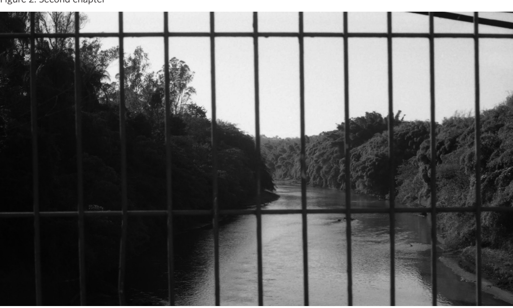
Figure 2. Second chapter

In addition, it is important to remember that in 2015, Member States of the United Nations signed a Global Agreement agreeing on objectives to be achieved by 2030 that aimed to eradicate poverty, protect the Planet and ensure that individuals achieve peace and prosperity. However, these objectives will only be achieved if the current development model is rethought.