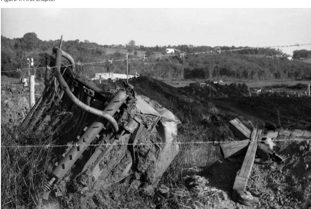
Figure 1. First chapter

These speeches were transcribed from videos made by the production of the event, publicly available on the YouTube website. It is possible to find it through the title of the seminar 'Disaster of Vale S.A. in Brumadinho: six months of impact and actions; 2019'.