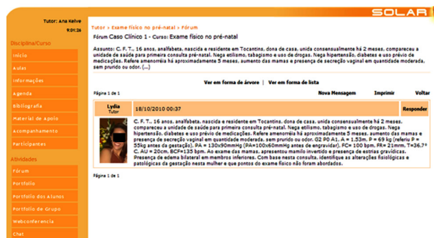
Figure 3. Discussion Forum in the hypermedia Physical Examination in Prenatal care, SOLAR, 2010

In order to complement the content available for the classes, the VLE provides other materials in the form of a hyperlink. Through this tool, students can have access to scientific articles, manuals and other sources of knowledge.