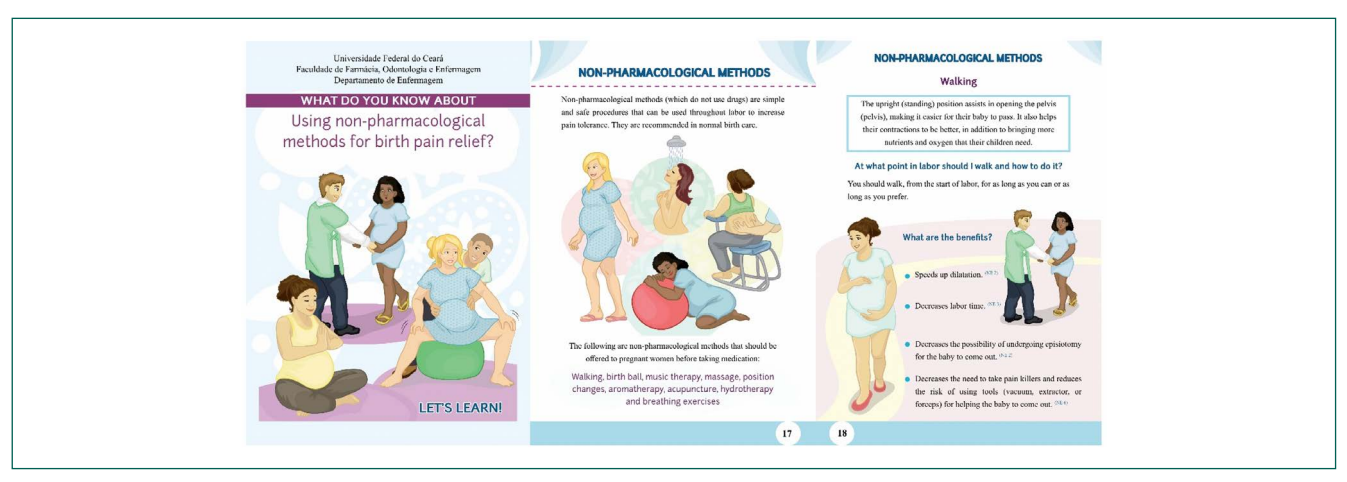
Figure 1. "What Do You Know about Using Non-Pharmacological Methods for Birth Pain Relief? Let's learn!" cover and pages