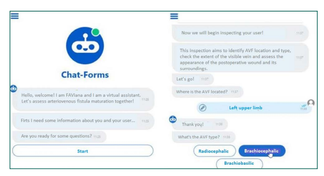
Figure 1. Representation of the robot-human interaction initial screen, indicating the emphasis on aspects of anthropomorphism in language and appearance

simulated by developers 1 and 2, independently. After that, adjustments were made to fit content and chatbot dialogue from editing directly in Chat Forms<sup>®</sup>. Regarding the more specific characteristics of the chatbot, the developers gave it a name that could indicate both its purpose and indicate an anthropomorphism with a name similar to that of human beings. Thus, the chatbot was named FAViana (Figure 1).