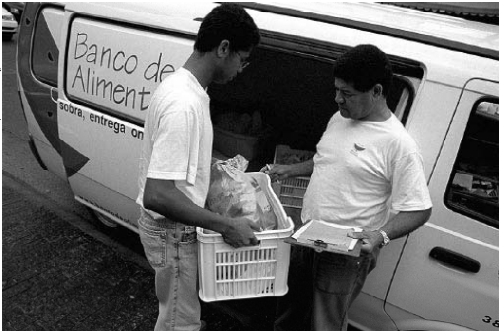
Technicians from the Banco de Alimentos NGO carry fresh breads from a bakery.