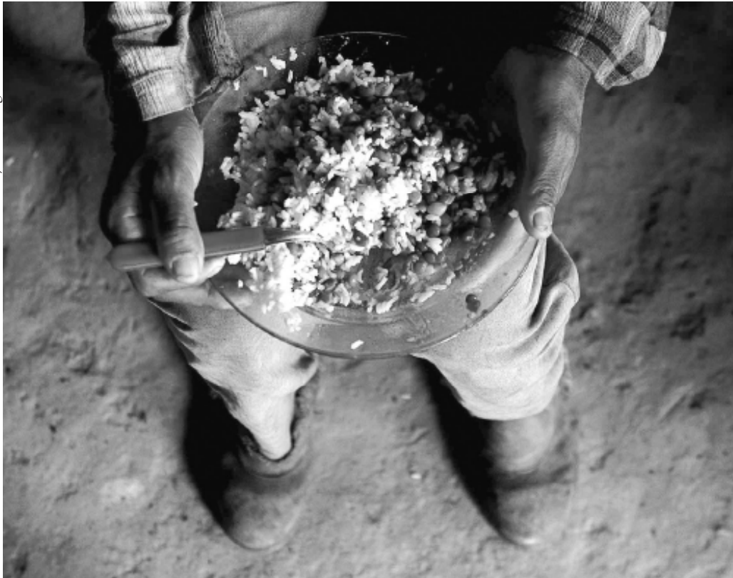
Farmer Novasto Alves da Rocha shows his plate with rice and beans in Guaribas, Piauí.

of monitoring the short- and long-range management of the policy's work. The PNAE, now more than 50 years old, undergoes constant readjustments to fulfill new demands derived from its increased coverage and by advances in knowledge about nutrition and health. The implementation of the income transference program led to improvements in the patterns of food consumption, especially among children up to 2 years of age.