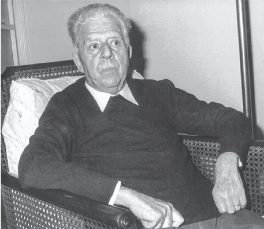
Eugenio Montale (1896-1981).