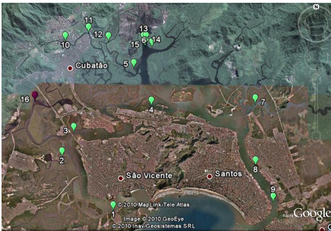
Figure S1. The Santos Estuarine System and sites where sediments were sampled. Important cities such as Santos, São Vicente and Cubatão are also indicated (source: Google Earth).

b Centro de Desenvolvimento da Tecnologia Nuclear (CDTN, campus da UFMG), Av. Pres. Antônio Carlos no. 6.627, 31270-901 Belo Horizonte-MG, Brazil