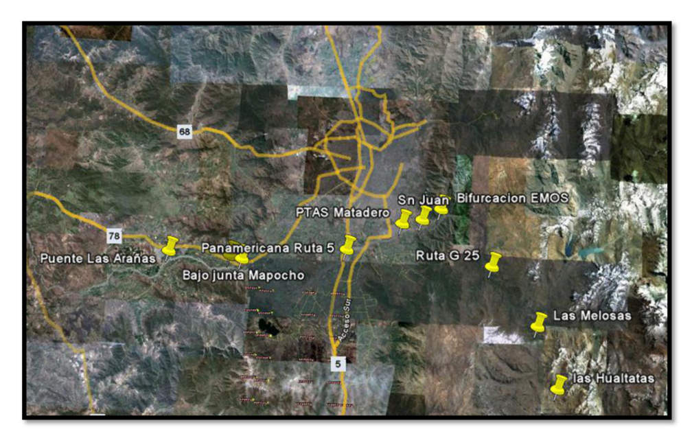
Figure 1. Location of the studied water sampling points in the Metropolitan Region