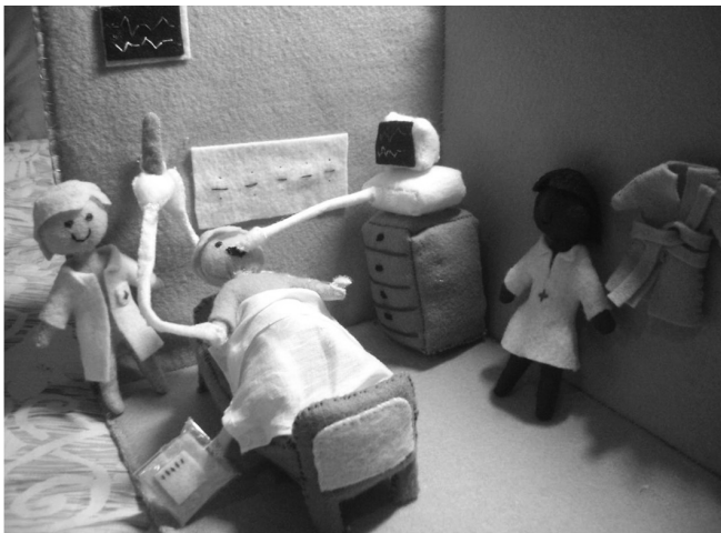
Figure 2 – Intensive care unit model.

Once scheduled day and time for the child's visit, a psychologist interview will evaluate the child's understanding on the hospitalization and disease process, his/her emotional maturity and confrontation resources. During the interview an ICU model is shown (Figure 2) so that playfully the child has a general physical space idea. The main questions are answered, as well his/her ideas demystified. Children often have fantasies about the explanations received (about tubes, probes, monitors, catheters) and normally these are much scarier than real life.