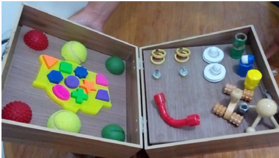
Figure 2 – Semi-enclosed therapeutic suitcase with the boards already stored showing the proposal of transport facility.

In the activity described, the therapist may ask the patient about the softest ball, the most important and their texture preference and ask them to describe the balls' texture with closed eyes. In this same activity, the patient accomplishes flexion and extension movements of the elbow and shoulder to reach the balls, promoting the elongation of the upper limb. If necessary, the therapist must intervene and assist in the obtention of maximum elongation supported by the patient or until s/he reaches the ball s/he wants.