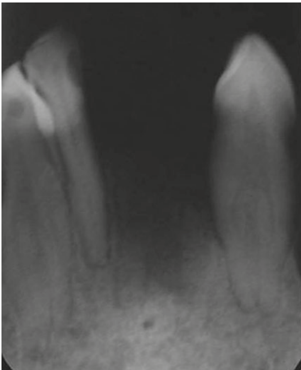
Figure 1. Initial radiograph.

However, the presence of two roots in mandibular canines is rarely observed (11,12). Quellet (5) described the occurrence of two roots and two canals in mandibular canines in only 5% of all analyzed teeth. Laurichesse et al. (4) described the second root of mandibular canines in only 1% of cases. A previous study that investigated the internal anatomy, direction and number of roots and