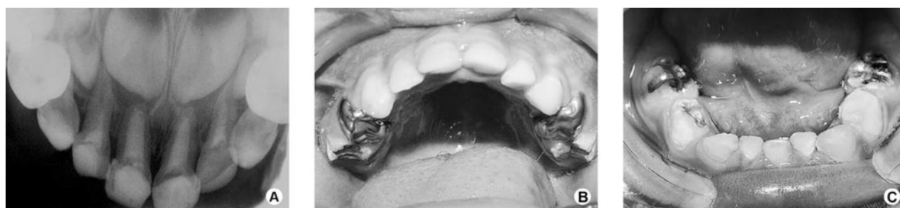
Figure 3. Rehabilitation comprising endodontic treatment and placement of stainless steel crowns, amalgam and composite restorations.

Given the number of sensitized individuals and assuming that this number will rise with increasing exposure to latex, an efficient latex protocol should be implemented in dental offices. Patients should be screened by taking a detailed medical history, and precautions should be used when treating individuals at high risk for developing latex allergies. These precautions should be continued until an allergist has verified the patient's allergic status, and