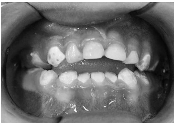
Figure 1. Preoperative clinical view showing active white spot lesions in the anterior teeth, multiple cavitated caries lesions, gingivitis, anterior open bite and missing primary mandibular right lateral incisor.

Ethics Committee approval (#2005.1.422.58.0) and