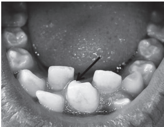
Figure 1. Mandibular left central incisor with abnormal crown morphology. Talon cusp is evident on lingual surface (arrow).

He had Class I molar relation and crowding of mandibular anterior teeth. There were no apparent manifestations of any systemic, genetic and syndromic disorders. Patient family history was non-contributory. The permanent mandibular left central incisor appeared larger in size with different crown morphology as compared with the contralateral incisor (Fig. 1). Talon cusp was observed on the lingual surface of the same tooth which was extending to the incisal third (Fig. 2).