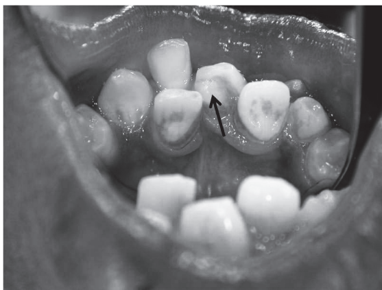
Figure 2. Mirror view of talon cusp on lingual surface of mandibular left central incisor (arrow).