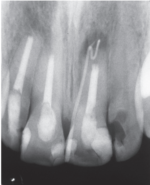
Figure 1. Preoperative radiograph. The root canal filling seems to be short of the apex probably due to an extensive beveling of the root tip during apex resection. No attempt at retrofilling is evident.

Radiographically, healing of the lesion and an induction of a hard tissue barrier apically to the MTA plug was evident (Fig. 4).