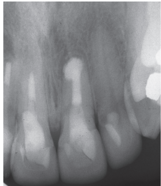
Figure 4. Four-year follow-up radiograph in which healing of the apical lesion is evident.