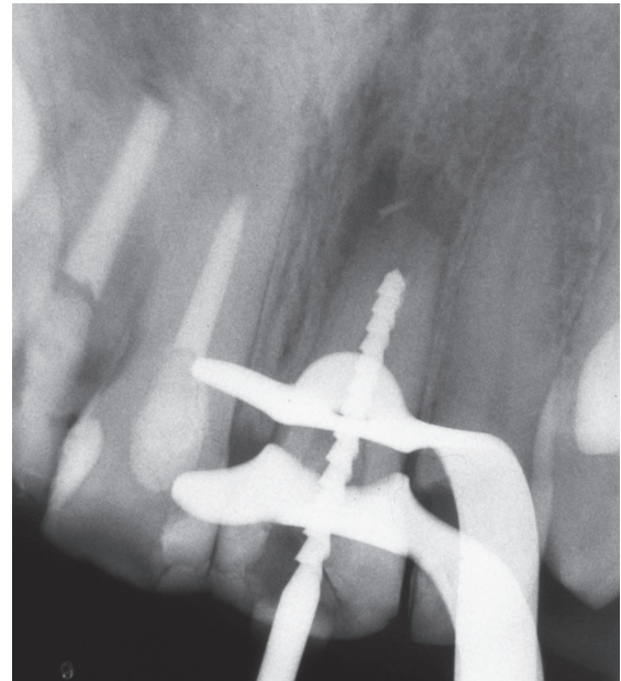
Figure 2. A #140 Hedström file was secured in place with the use of apex locators, but the estimation of the working length was inconclusive.