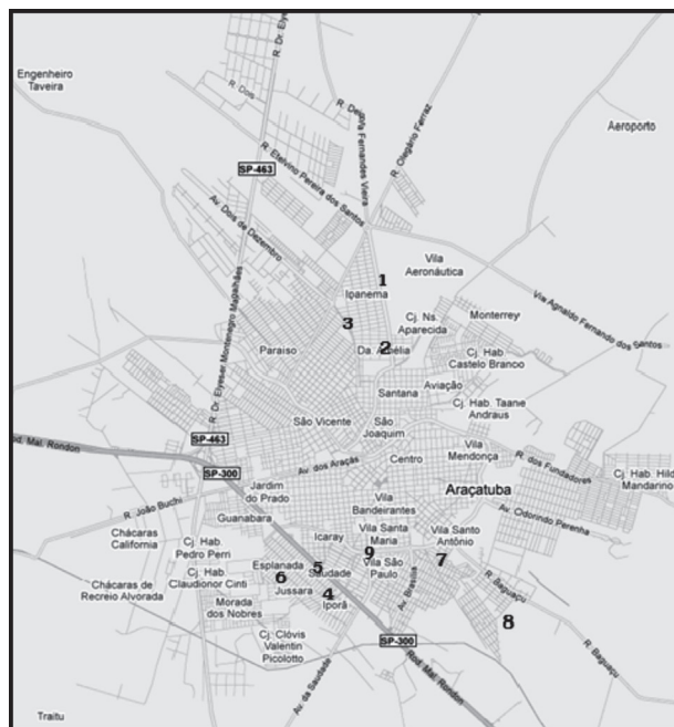
Figure 1. Map of Araçatuba, SP, Brazil, 2011, according to the water supply sources divisions and the respective water collection sites of the study.

The samples were collected once a month on weekdays at previously established collection sites and analyzed in duplicate between November 2004 and October 2010 at the Research Laboratory of the Nucleus for Public Health (NEPESCO) of the Public Health Graduate Program from Araçatuba Dental School/UNESP, Brazil, totalizing 9 samples analyzed in duplicate every month.