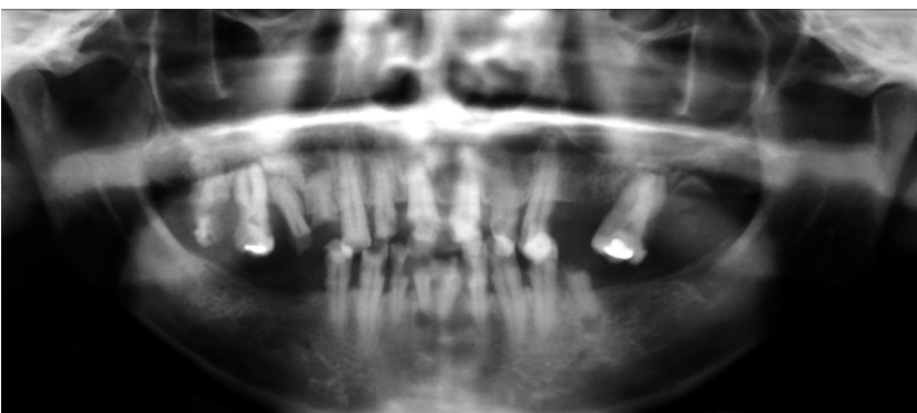
Figure 3. Case 4. Panoramic radiograph showing generalized tooth destruction due to cGVHD-related caries. Note evident cervical and incisal carious lesions.