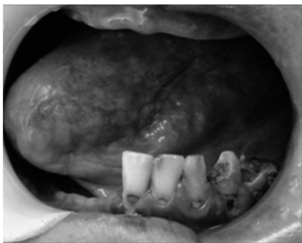
Figure 4. Case 5. Clinical intraoral aspect after 18 years of post-alloHSCT follow-up showing extensive tooth loss, the presence of cervical cavities due to recurrent failure of the cervical dental restorations and a consequent generalized dental destruction due to cGVHD-related caries.

The current case series aims to call attention to an aggressive form of decay following allo-HSCT, which presents several clinical similarities to radiation-related caries. Also, considering that allo-HSCT patients do not