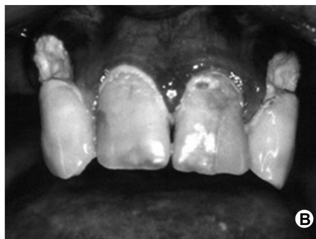
Figure 1. A. Case 1: Incipient clinical patterns of cGVHD-related caries can be seen as generalized superficial carious lesions predominately involving cervical and incisal areas of anterior and posterior teeth. Note that early cervical and incisal carious lesions may develop as well-limited brown pigmentations. B. Case 2: Discrete brown discoloration affecting the smooth surfaces of noncavitated enamel of anterior teeth were observed in association with advanced cervical cGVHD-related caries that tended to result in tooth crown amputation.