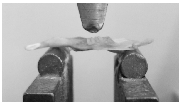
Figure 1. Positioning of the sample for the bending test.

Changes in bone physiology are one of the oral complications due to radiotherapy, and it may trigger more severe oral complications, like osteoradionecrosis.