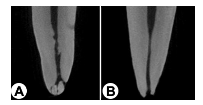
Figure 1. Coronal reconstructions of micro-CT showing presence (A) and absence (B) of ramifications in the apical region of the roots.

The scanning data set of the teeth was imported into the NRecon software (Bruker, Kontich, Belgium) for reconstruction. Then, using the DataViewer software (Bruker, Kontich, Belgium), each dental root, especially of the multi-rooted teeth, was adjusted so that the root axis was parallel to the sagittal plane. The apical limit was established at the level of the main foramen to standardize