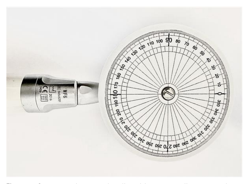
Figure 1. Custom angle-measuring disc with a 50-mm diameter used as a target object.

Briefly, a custom angle-measuring disc with a 50-mm diameter (Figure 1) and a shaft designed to fit into the chuck of the handpiece was manufactured from polypropylene by a computer numerical control machine. Four major lines at every 90° and 68 minor lines at every 5° were engraved on the disc as reference lines for visual kinematic analysis. One of the major lines was marked with black ink to serve as the main reference for image analysis. The target object ( i.e. , measuring disc) was inserted into the contra-angle of each endodontic motor (X-Smart Plus, VDW.Silver or iRoot), which was then attached to a clamp in front of a lens (M31711) coupled to a high-speed camera (Phantom VEO 710, Infinity Photo Optical Company, Centennial, CO, USA) and kept at a distance of 0.3 m. All parts and surfaces were aligned by using a water level. The camera was set to high-speed video mode at 2400 frames per second (fps) with 800 x 800-pixel resolution and recorded in CINE format. The recording environment was illuminated by using a light source (GS Vitec SN: 6500068, GS Vitec Gmbh, Bad Soden-Salmünster, Germany) with an output of 7000 lumens. Each endodontic motor was recorded 4 times for 10 seconds.