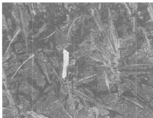
Figura 2 - Apical ear mutant growing in the field, Ames, Iowa, 1994.

Another undesirable trait observed in ape mutants was an excessive number of leaves, which were spaced closely on the main stem. In spite of their short height, these mutants produced and